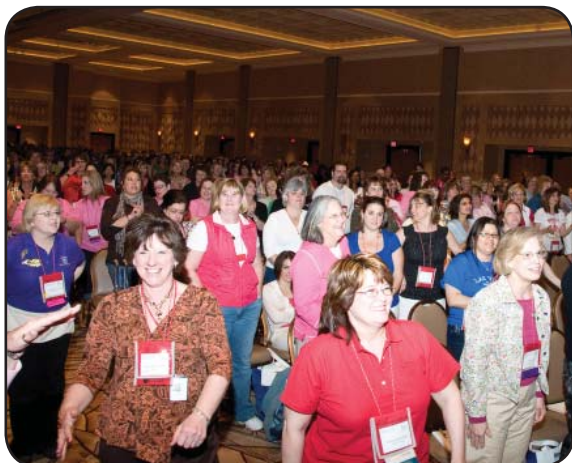
2009 AAPC Las Vegas National Conference