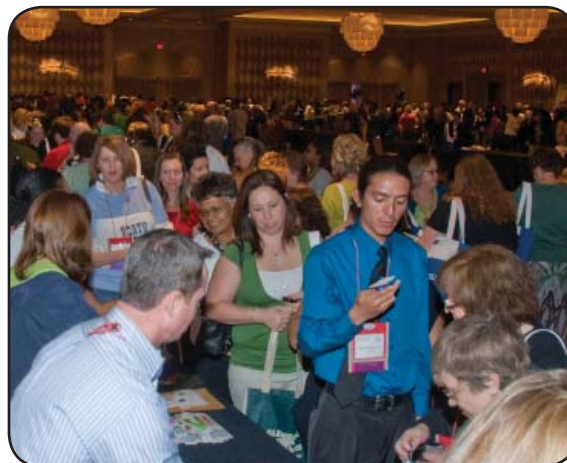
Las Vegas Exhibit Hall